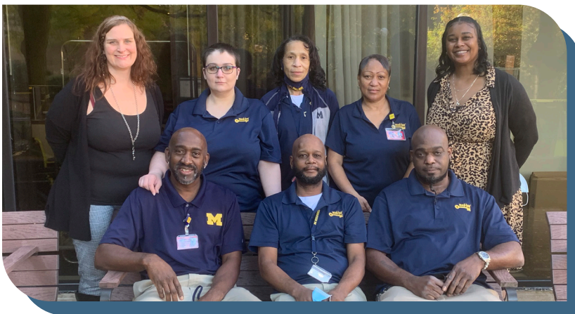
Med Inn Hotel Staff Members

UMHS provides patients and visitors with the choice of three programs to meet their lodging needs: the on-site 30-Room Med Inn Hotel, Respite House, and Michigan Medicine Lodging. Each option has the same mission and purpose: to provide a place of respite for our patients, their families, and visitors.