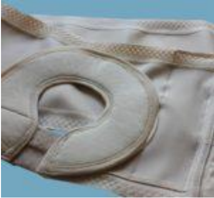
Safe n Simple -Support around the belt opening