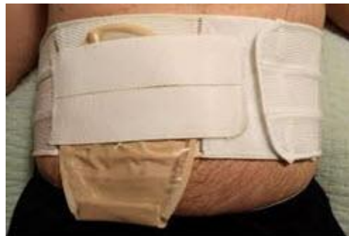
Nu-Hope Belt with prolapse cover