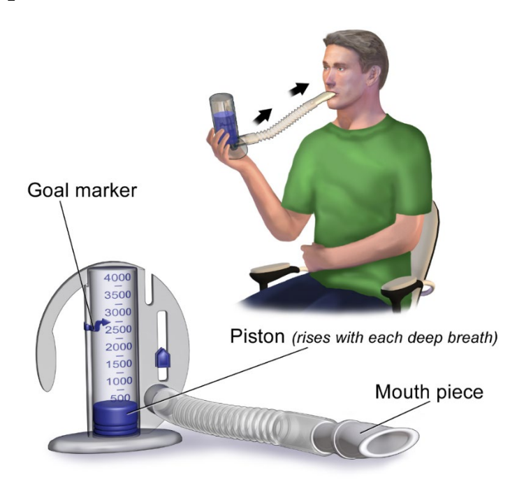
How to Use an Incentive Spirometer By BruceBlaus - Own work, CC BY-SA 4.0