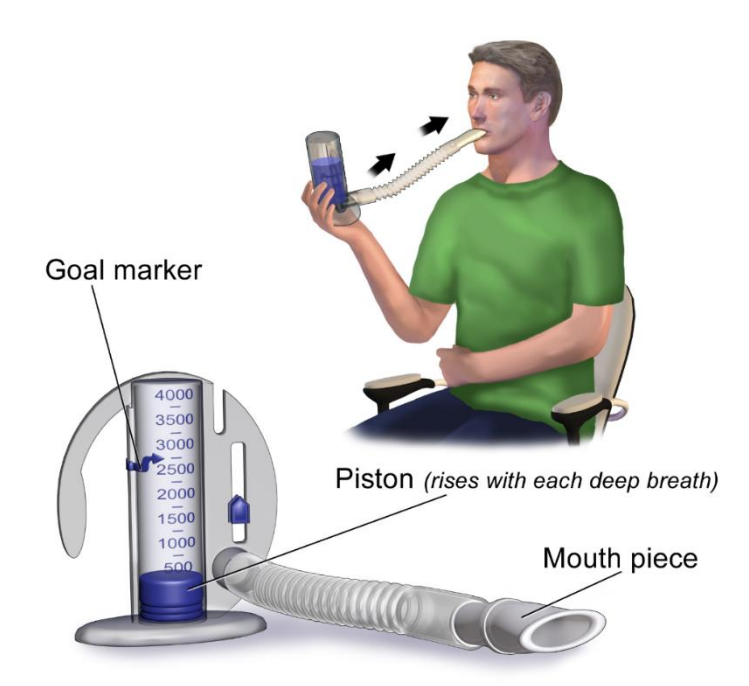
How to Use an Incentive Spirometer By BruceBlaus - Own work, CC BY-SA 4.0