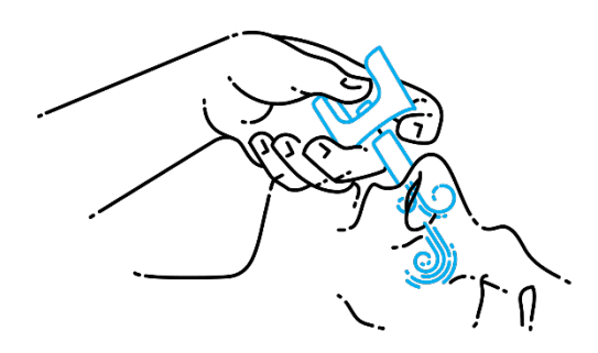
Step 3: Push on the plunger to spray and hold for 2-3 seconds

Step 2: Place the tip in the person's nostril