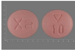
利伐沙班 10 毫克药片