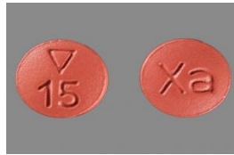
利伐沙班 15 毫克药片