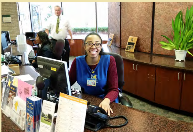
Ariel Odlum Entrance Services