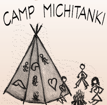
MICHIGAN TRANSPLANT KIDS

There were many successful events this summer that helped raise much needed funds for Camp Michitanki and the Transplant Center. Thanks to all of you who participated by either volunteering your time or making a donation.