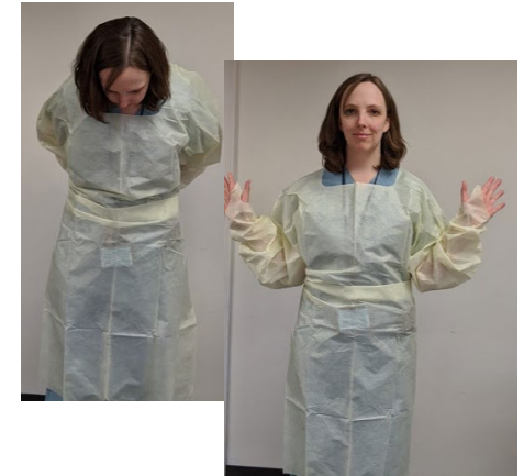
3. Don gown. Tie gown in back.