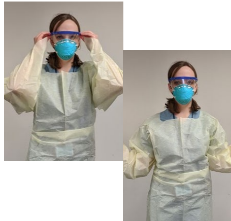
5. Don eye protection