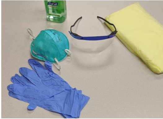
1. Gather Supplies (gown, gloves, N95, eye protection)