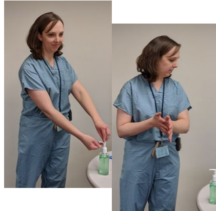
2. Perform hand hygiene