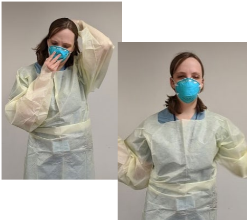
4. Don N95 respirator, ensuring a tight fit