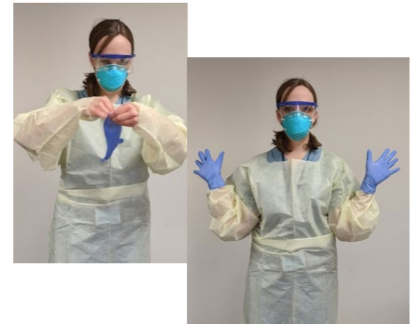
6. Don gloves