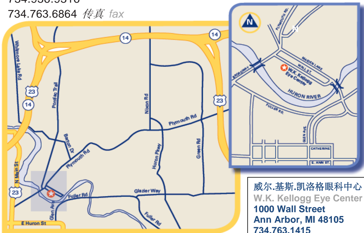
地图插页 Map Inset

威尔.基斯.凯洛格眼科中心 W.K. Kellogg Eye Center 1000 Wall Street Ann Arbor, MI 48105 734.763.1415