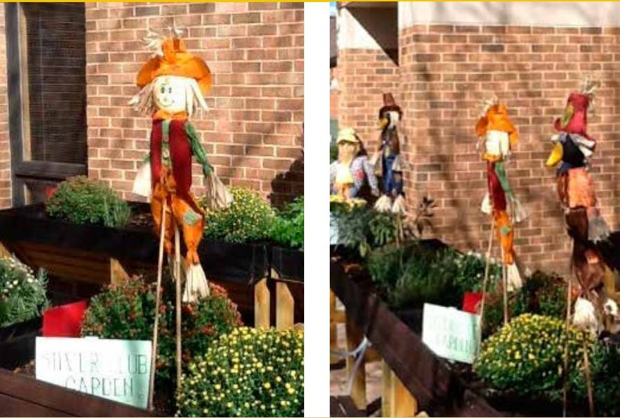
Silver Club Mum Garden 2017