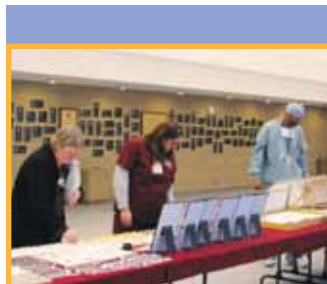
This past February, Friends sponsored a three-day jewelry sale that raised $9,895 to benefit and support Trails Edge Camp.