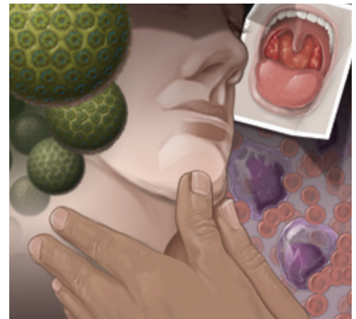
ILLUSTRATION BY MICHAEL KRESS-RUSICK

Data collected more than 30 years ago on the incidence of infectious mononucleosis show the highest rates in persons 10 to 19 years of age (six to eight cases per 1,000 persons per year). 2,3 The incidence in persons younger than 10 years and older than 30 years is less than one case per 1,000 persons per year, 2,3 but mild infections in younger children often may be undiagnosed. The infection is most common in populations with many young adults, such as active-duty military personnel and col-