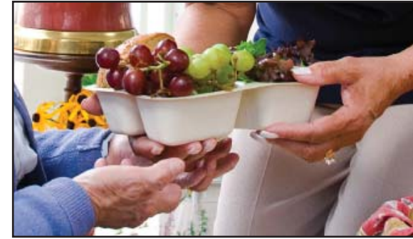
Motor Meals, making a difference one meal at a time.

The reason? The Older American's Act only provides partial reimbursement for meals delivered to persons 60+.