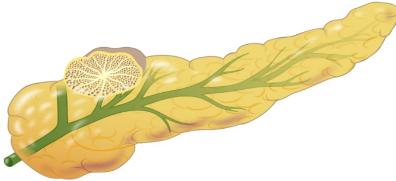
Serous Cyst Adenoma