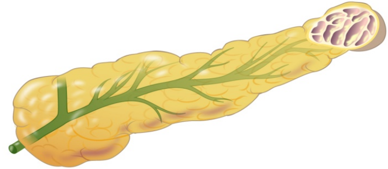
Mucinous Cystic Neoplasm