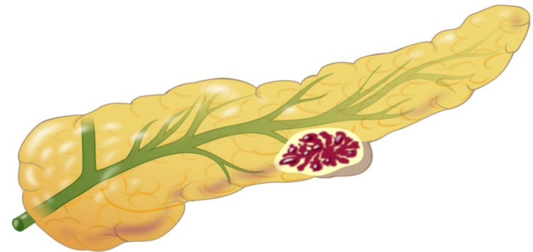
Solid Pseudopapillary Tumor