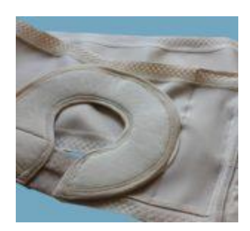
Safe n Simple - Support around the belt opening

5. Available in 3 widths and several sizes. For more information visit the Safe n Simple website at: www.sns-medical.com or call 844-767-6334.