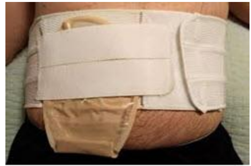
Nu-Hope Belt with prolapse cover