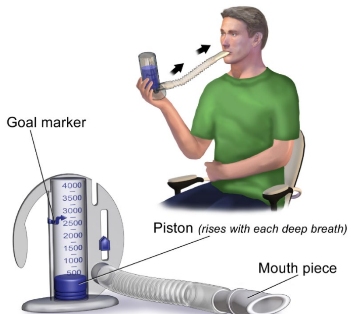
How to Use an Incentive Spirometer