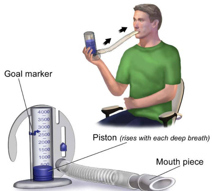
How to Use an Incentive Spirometer