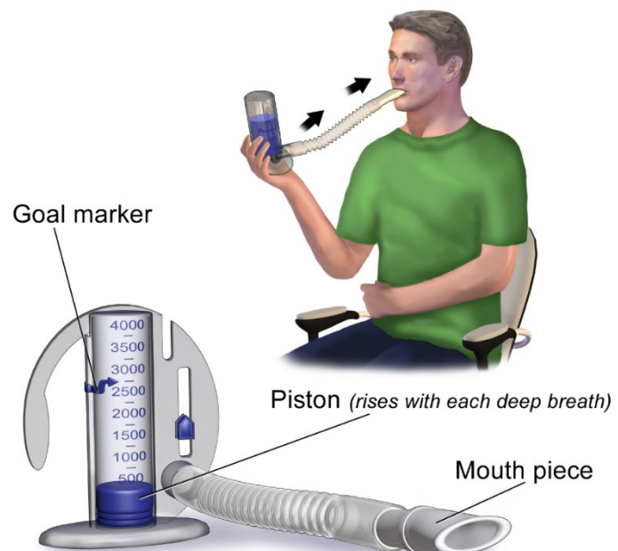
How to Use an Incentive Spirometer