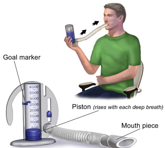
How to Use an Incentive Spirometer