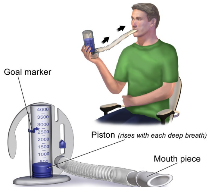
How to Use an Incentive Spirometer