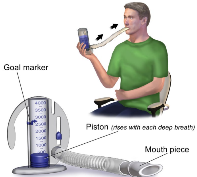
How to Use an Incentive Spirometer