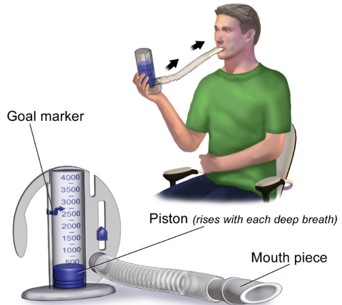
How to Use an Incentive Spirometer