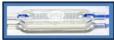
Capillary device (should be taped to your skin)