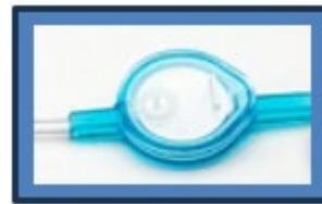
Air filter (should not be taped to your skin)