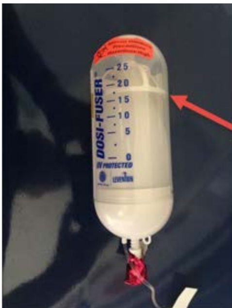
Figure 1: EIS is full