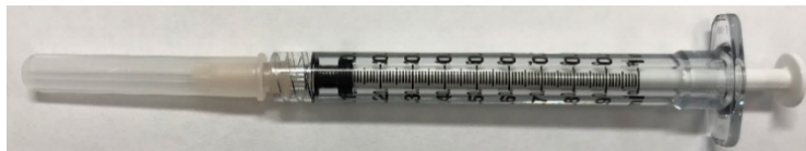
1 subcutaneous needle attached to 1mL syringe