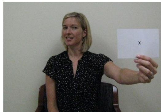
Head Turns Right while "X" moves Left. Eyes stay on "X".