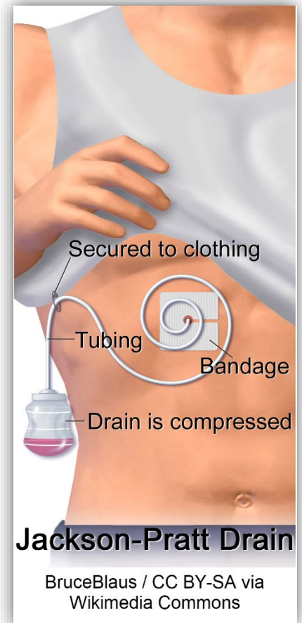
Image showing proper JP drain setup (drain compressed to allow gentle suction) with tubing pinned to shirt.

A JP drain will prevent seromas. A seroma is fluid trapped underneath the skin. The drain allows the fluid to empty into the bulb instead of accumulating underneath the skin.